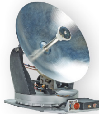
Tail Mount Antenna

Jetwave™ is the hardware that gives Falcons the ability to connect to Inmarsat's Ka-band network – Jet ConneX™ - for global, seamless, high-speed in-flight connectivity.