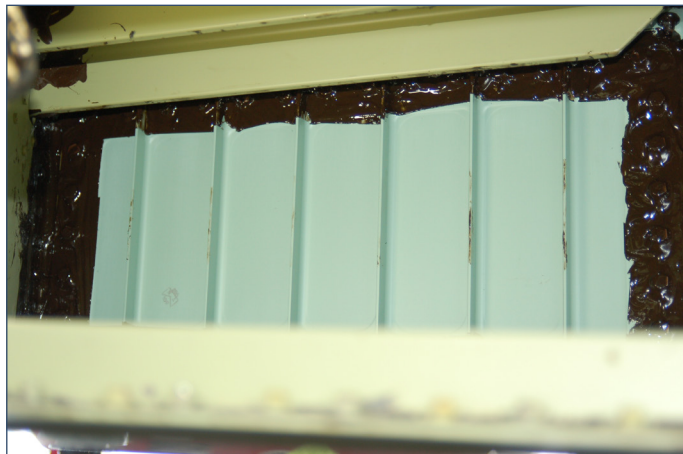
Door Installation and Sealant Coating