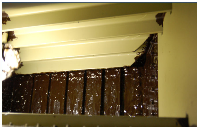
Successfull Dry Bay

For further details, please contact your DFJ service center Regional Sales Manager or e-mail DFJServiceCenters@dassaultfalconjet.com .