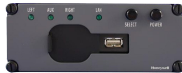
USB Data Loader DL-1000