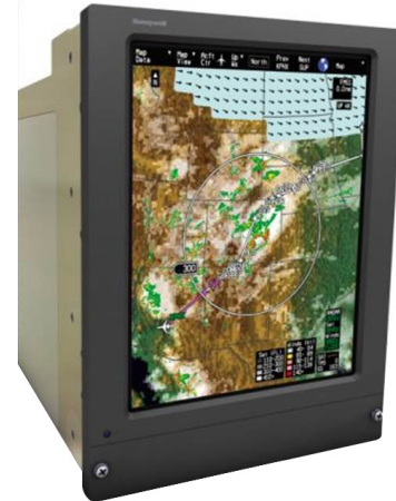
LCD Display Unit DU-875